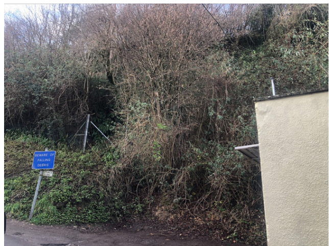
These photographs show the layby and the height of the bank. The building is a residents garage. On the left hand side the end of the fence is visible.