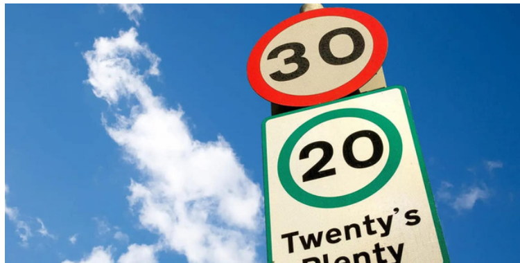
Advisory 20mph sign