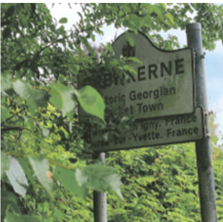
A356 Broadshard (Approach road from A303)