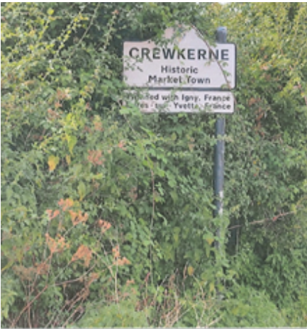
Station Road, Crewkerne.