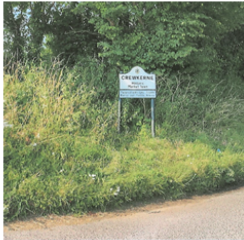
B3165 Maiden Beech (From Lyme Regis)