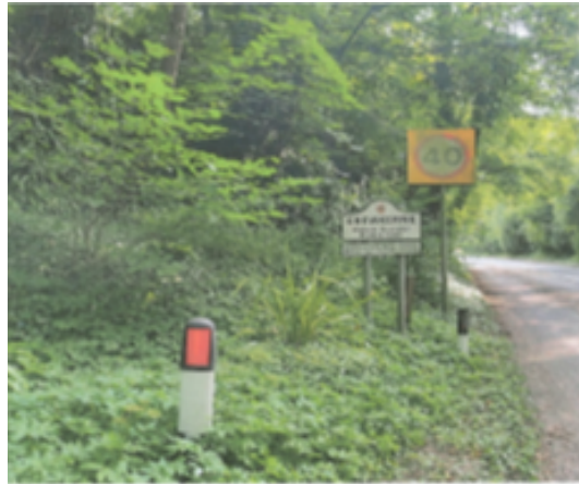
A30 Crewkerne Hill